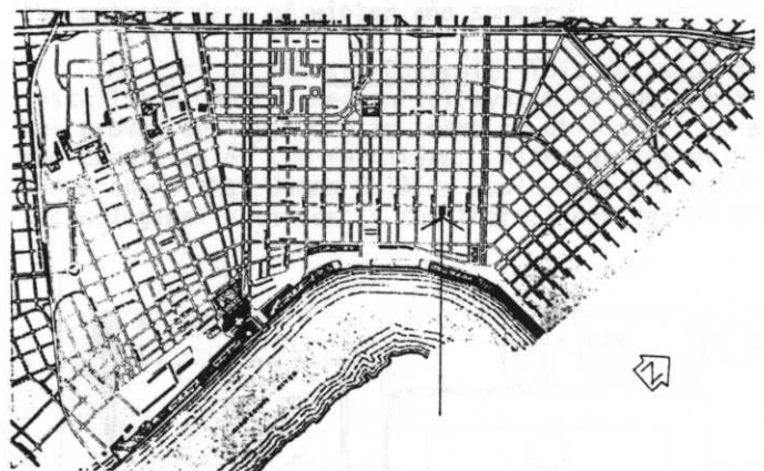
Fig. 2 Location of Gallier House in the French Quarter, New Orleans, Louisiana

Designed in 1857 by the local architect James Gallier, Jr., this early Victorian is located on Royal Street in the French Quarter of New Orleans.